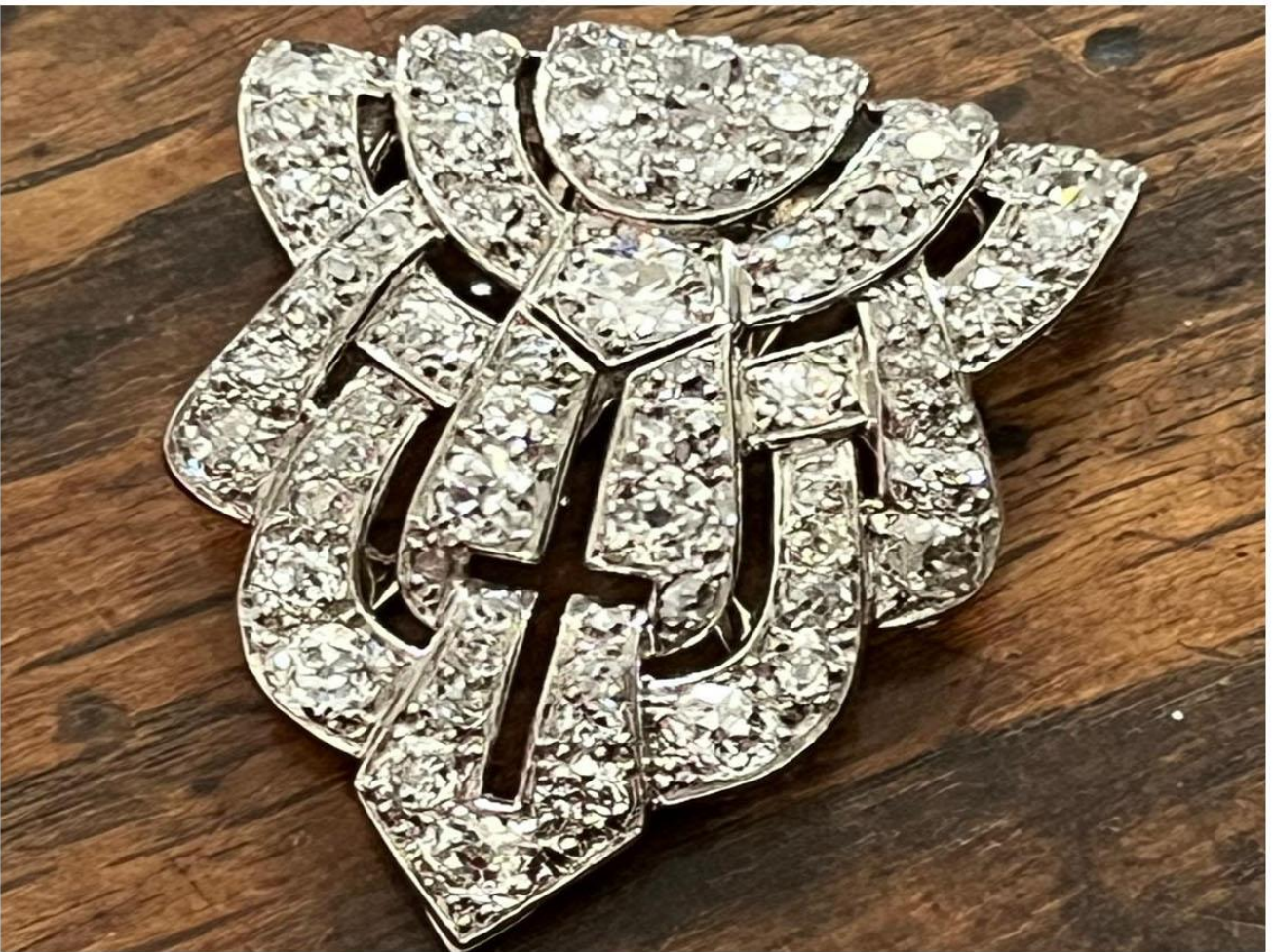
Lot 386 – An art-deco style diamond clip brooch of ribbon design