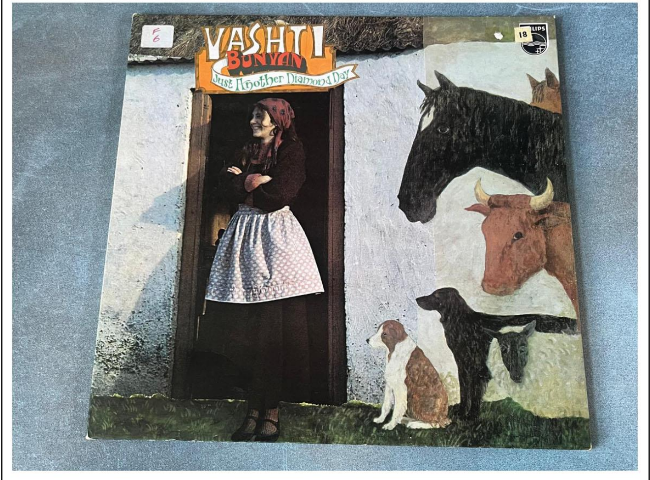
Lot 119 – A Fred Manshaw 9ct gold gas lighter Lot 225 – A 'Vashti Bunyan' LP vinyl album 'Just Another Diamond Day'