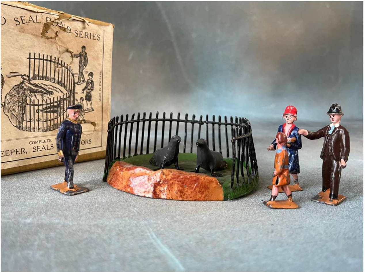
Lot 226 – A Charbens painted lead 'Performing Elephants' set from The Circus Series Lot 225 – A Taylor and Barratt seal pond set