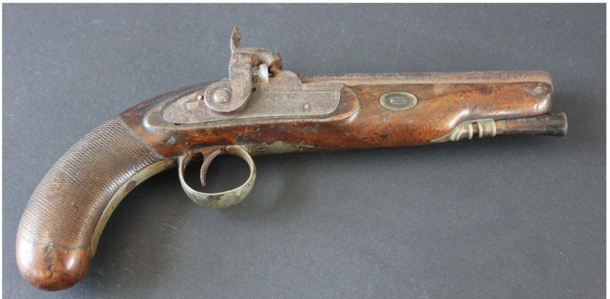
Lot 188 – Pair of Tiffany Candlesticks Lot 66 – A 19th century mahogany percussion pistol