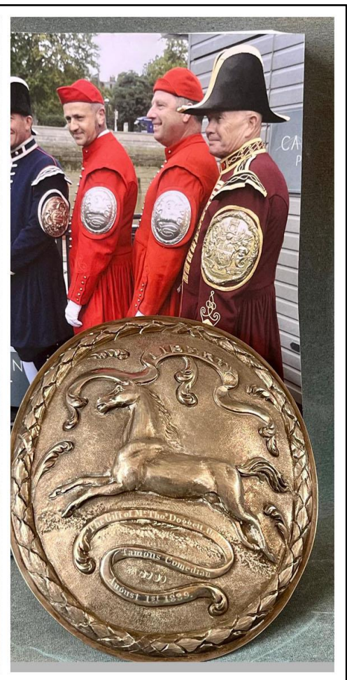
Lot 364 – Walter Richard Sickert Painting Lot 2 – General Service Cyprus Medal Lot 267 – Sindy and other Dolls Lot 412 – Doggett Waterman's Badge