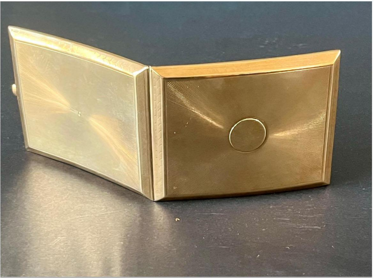
Lot 118 – A 9ct gold rectangular cigarette case