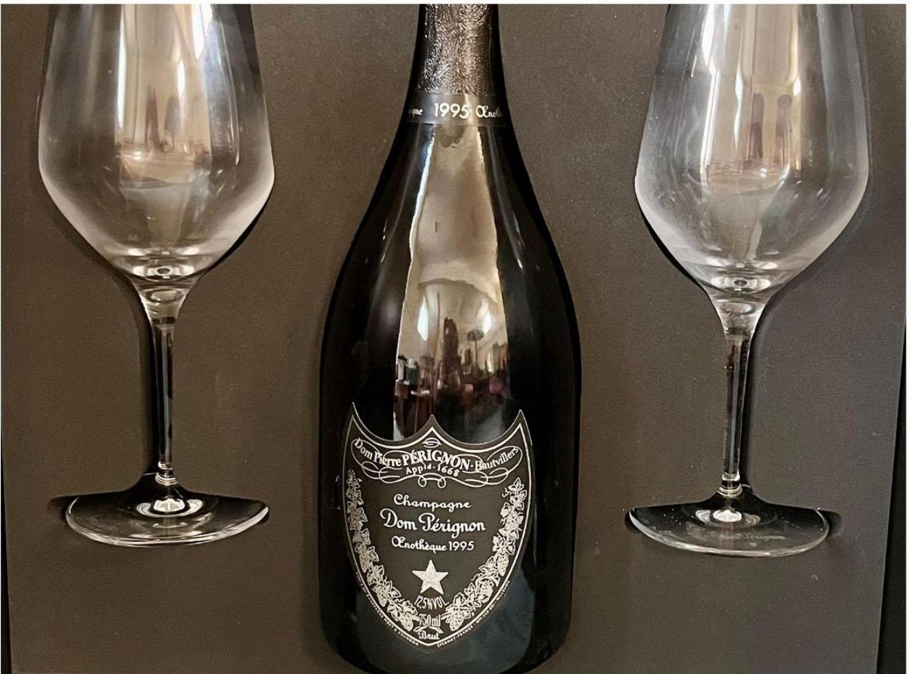
Lot 163 – A bottle of Dom Perignon 'Oenotheque' 1995 champagne, with glasses